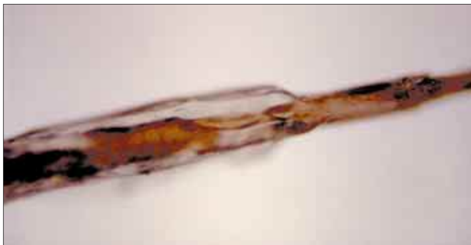
Figure 1. Head hair recovered from underneath the seat cover of the suspect's car.

Two nanograms of DNA from each sample were amplified and typed simultaneously at the three STR loci, TH01, TPOX and CSF1PO using the then newly developed GenePrint™ STR Multiplex System (CTT).